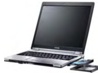
RAID Level 1 support as a secure means of data backup in select business models such as the Portégé M750.

RAID Level 1 protects user data by providing an automatic backup. Data from the primary hard disk drive (HDD) is mirrored (copied) onto a second HDD. If the primary drive fails or data becomes corrupted, the system automatically reads from the second one.